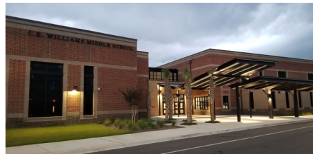
The new CEW South Campus building that serves 7th and 8th grade students

In the 2020-2021 school year, CE Williams and West Ashley Middle Schools combined into one CE Williams Middle School. In order to accommodate the increased student population, all 6th grade students attend the CE Williams North Campus located on the former West Ashley Middle School campus. All 7th and 8th grade students attend the CE Williams South Campus which is located in a brand new facility. Each Campus is able to be developmentally responsive to their respective student population. Each campus provides a wide range of course offerings to meet the needs of each student. Furthermore, each campus utilizes PBIS and SEL instruction to create a supportive environment built on our five principles of Prepared, Respect, Integrity, Dedicated, and Engaged.