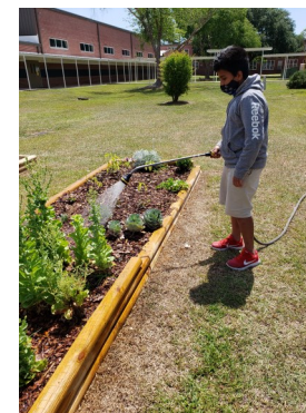
CEW North Campus scholar taking care of the campus garden. Hands-on learning helps scholars make real-world connections.