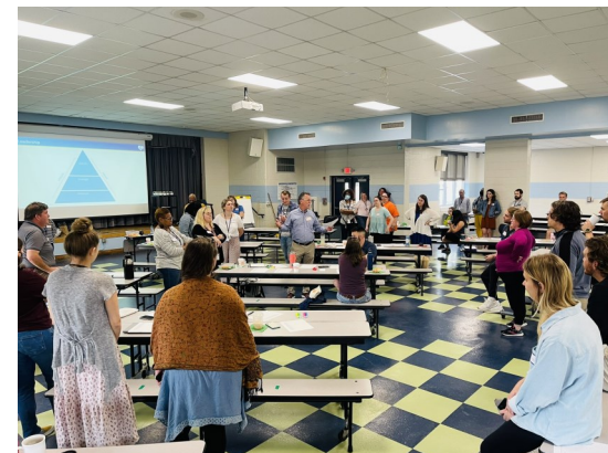
CEW North Campus faculty and staff participating in community building activities.