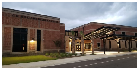
The new CEW South Campus building that serves 7th and 8th grade students

Furthermore, each campus utilizes PBIS and SEL instruction to create a supportive environment built on our five principles of Prepared, Respect, Integrity, Dedicated, and Engaged.