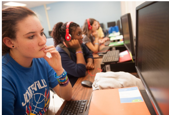
Students explore STEM through the Google CS First Club.