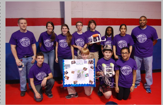
CEWMS SeaPerch Award Winning Team