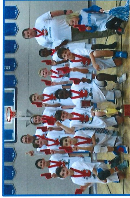
Boys' Trident League Division II Basketball Champions!