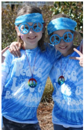
Oyster Roast Fun