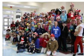
Dr. Seuss's Birthday