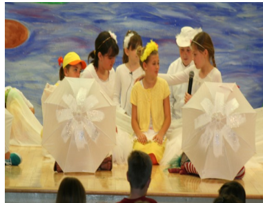
5th Grade Musical: Honk