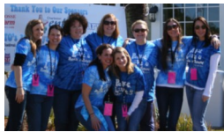
Oyster Roast Volunteers