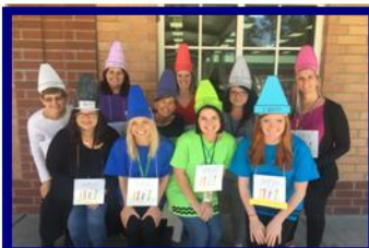
Superintendent, Dr. Gerrita Postlewait

x axis = national percentiles y axis = # of students 50 = National average