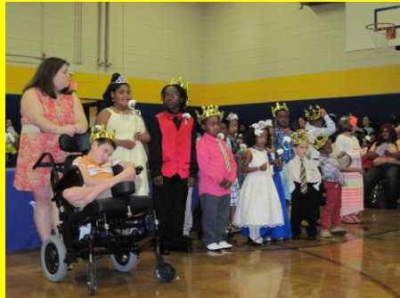
"Bear Paw Pageant"

Mary Bramlett Elementary School is a child-centered school educating and encouraging our young people for success in school, and the discipline to become better citizens, and preparing them for their lives as adults.