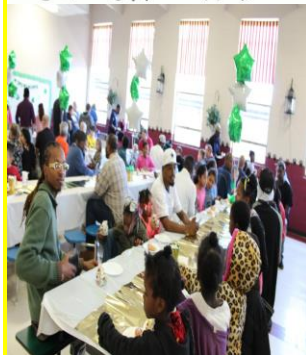
Donuts for Dads