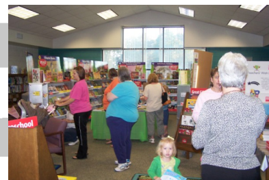
Grand Morning-Grandparent Day