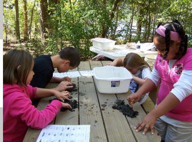
3rd grade to Camp Cherokee

Community friends help make the Goucher Reading Patio a reality! THANKS TO ALL OF YOU!!