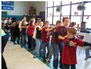
Relay for Life Christmas Dance