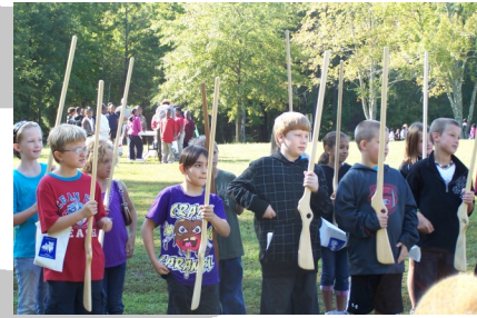
4th grade to Cowpens Battleground