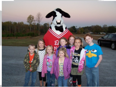
Chick-Fil-A Biscuit Breakfast