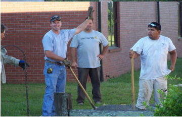
Visitors at the Reading Patio during the dedication ceremony.