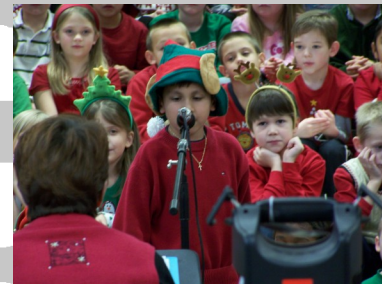
1st and 2nd grade Holiday Program