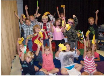
Mrs. Miller's class showing off their banana bucks on their way to a shopping spree at the Banana Buggy.