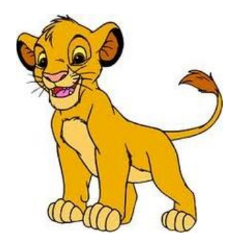
Spring 2015 Annual Report to Parents

The purpose of this report is to inform community members and parents of the accomplishments and goals of the CES School Improvement Council. Included you will find test scores, awards, and programs offered at our school.