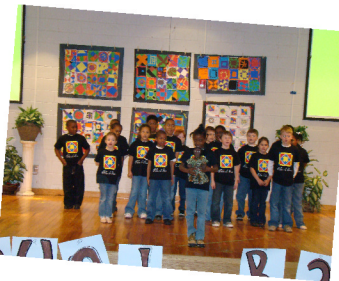
2nd Grade - Black History month performance