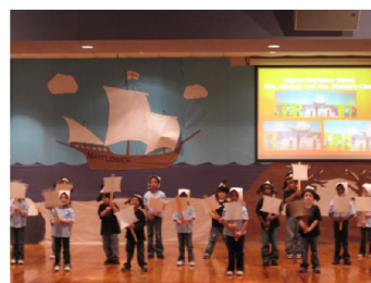
Kindergarten Thanksgiving production