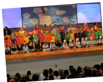
Kindergarten Thanksgiving production