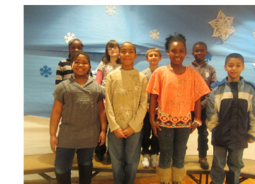
Spelling Bee Classroom Winners