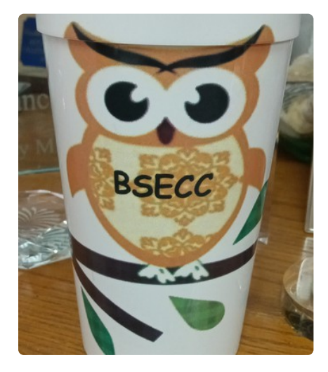
$2 BSECC Stadium Cup