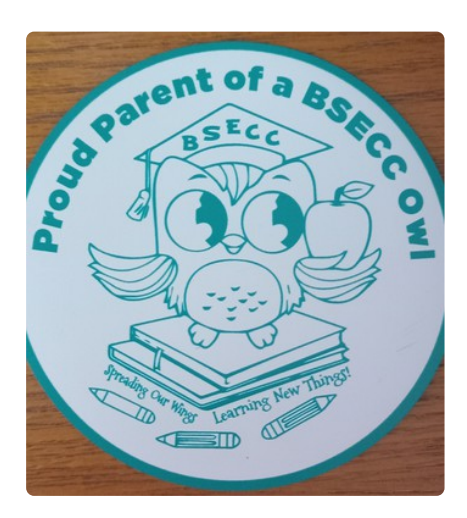
$5 Car Magnet