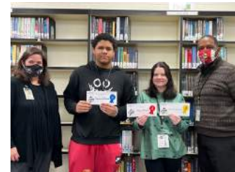
ACT Workshop Prize Winners