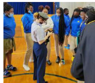
JROTC Middle School Visit