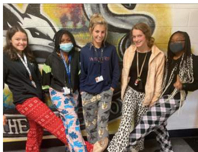
Red Ribbon Week