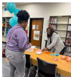
Honor Roll Celebration