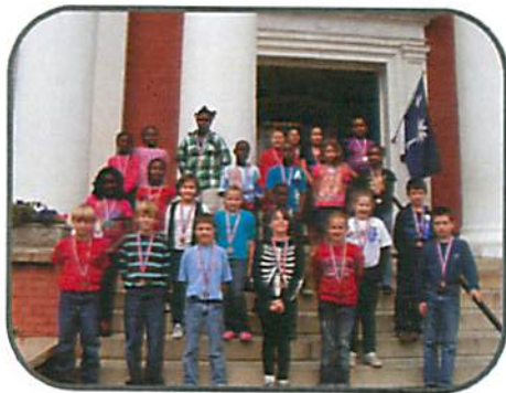
Outstanding Academic Achievement

Our School Improvement Council reviews our goals and achievements and reports progress to our school family and community. At St. John's Elementary, we believe excellence is achievable and always worth the investment.