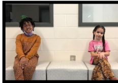
Wild About Reading