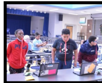
Celebrating Goals Met