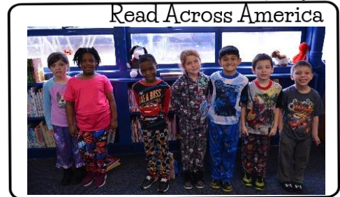
"The Sleep Book"