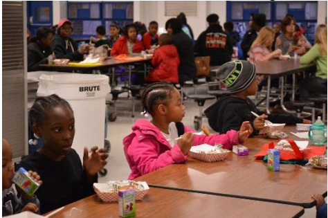
Family Literacy Night