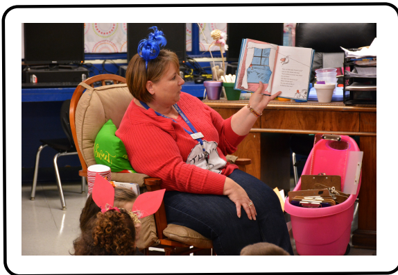
Family Literacy Night