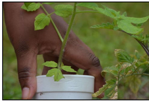
Tekoyia Washington prepares to plant tomatoes in the SFHS garden.