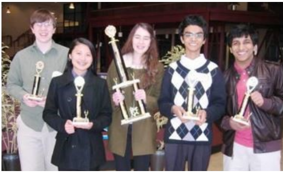
Wilson's Math Team wins 1st place in the Florence Darlington Technical College Technical Mathematics Competition.