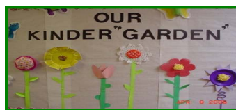
Right from the start...