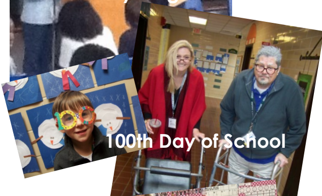
100th Day of School