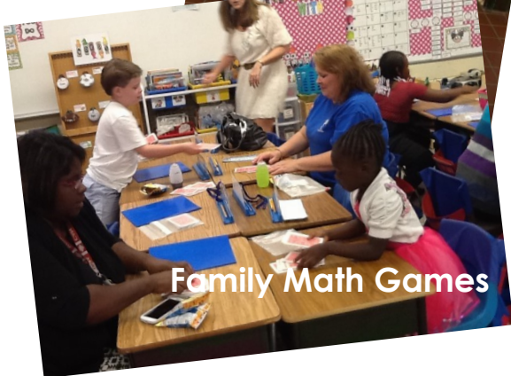
Family Math Games