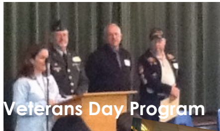
Veterans Day Program