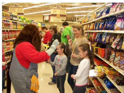
Dedicated Faculty and Staff