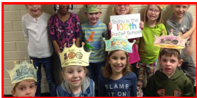
Right from the start...