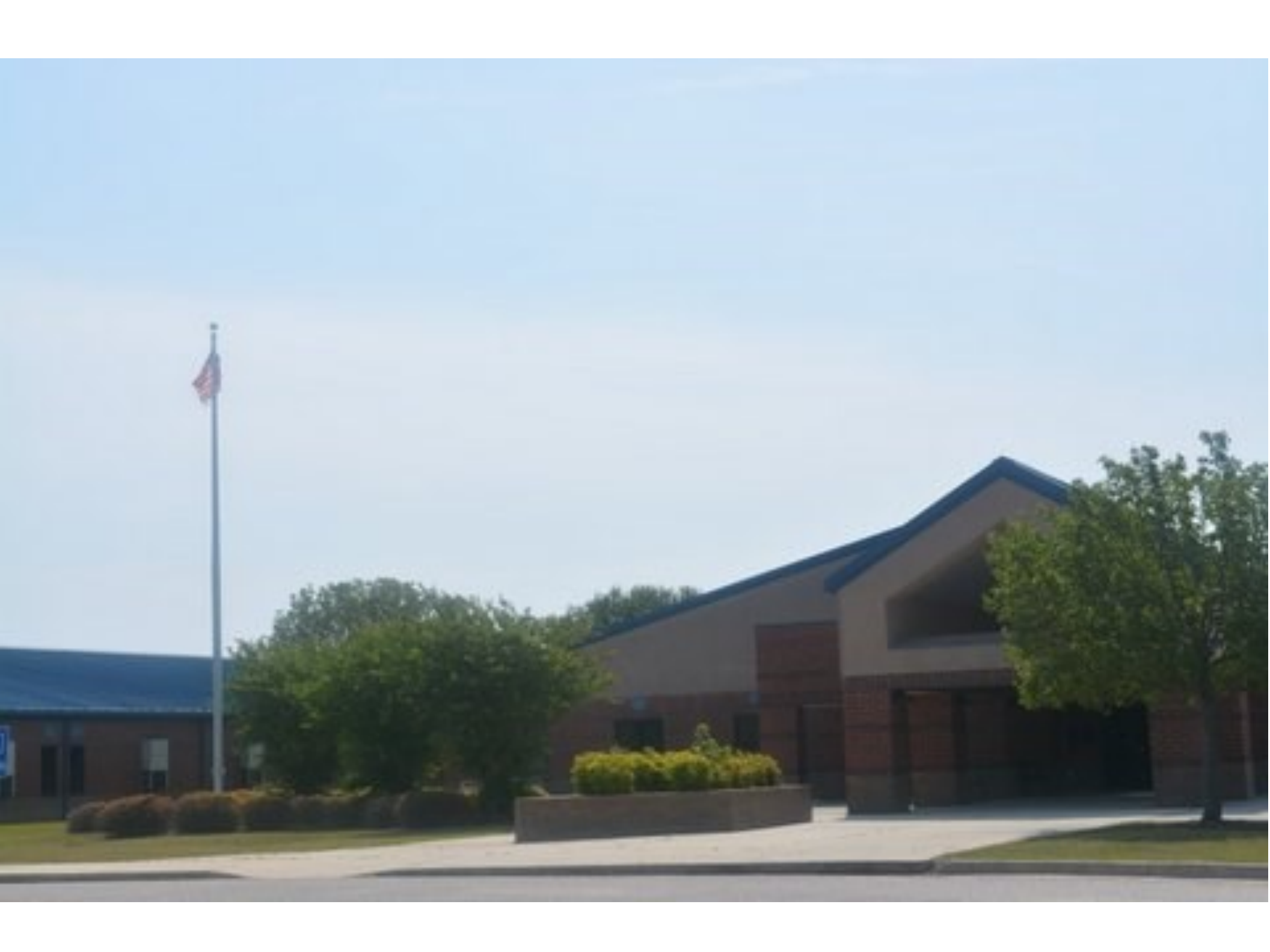
We continue to build upon and refine our proven foundation of good work, honored traditions, and continued excellence in education.