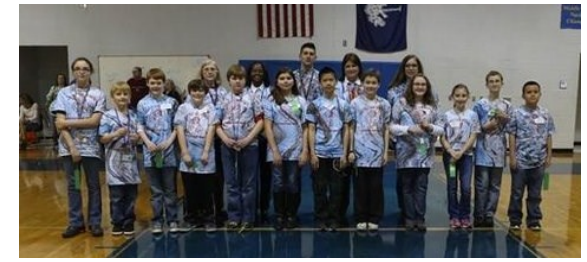
Georgetown Middle was the Grade 6 second-place team at the GCSD Academic Fair on March 8.

CONGRATULATIONS! Walmart presents twenty GMS teachers with $50 and a 'goody'bag'.