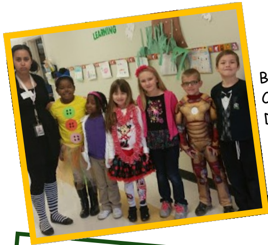
Book Character Day