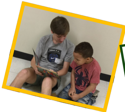
Eastside High School Tutors