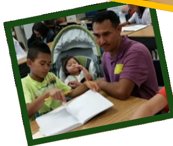
Student Led Conferences