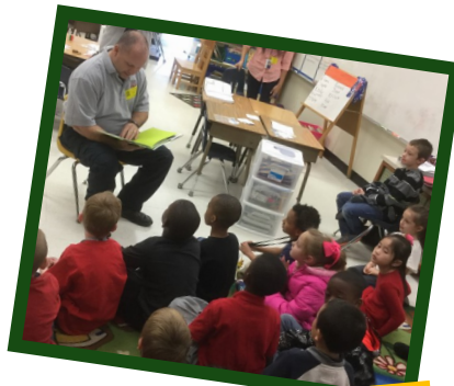
Taylor's Fire Department