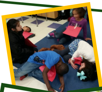
Social Studies Re-enactment

Most Diverse School Safe Routes Gold 2016 Safe Kids United Way Excellence Donor's Choice Recipients