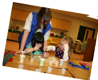
Math & Science Carnival

A combined of our Parent Involvement Department and our Parent Teacher Association at our school has and continues to positively impact the students, teachers, staff, and families in our community. The efforts and initiative pursued by the members of our PTA help to increase parental involvement while providing fundraisers and activities that enhance our school. A very special thank you to all who serve because their service helps to enhance our school/community resulting in numerous opportunities for parent involvement activities and workshops.