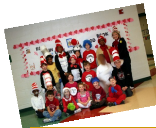
Book Character Day