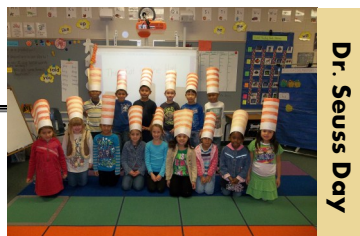
Dr. Seuss Day

The mission of Armstrong Elementary School is to prepare productive citizens in a democratic society by promoting a desire for lifelong learning, a mastery of basic academic skills, multicultural awareness, character education, and creative critical thinking skills in cooperation with the home and community.