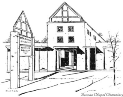
Duncan Chapel Elementary

Duncan Chapel Elementary has been educating students of the community for many years. The original one-room school opened its doors in 1878. Sometime after 1910, the little one-room school became too small for the ever-increasing number of students; and around 1912 it was abandoned for a brand-new, two story wooden structure built on the site of the present school. The current facility was dedicated in 2000. In the fall of 2018, Duncan Chapel Elementary celebrated 140 years of educating students of Greenville County.