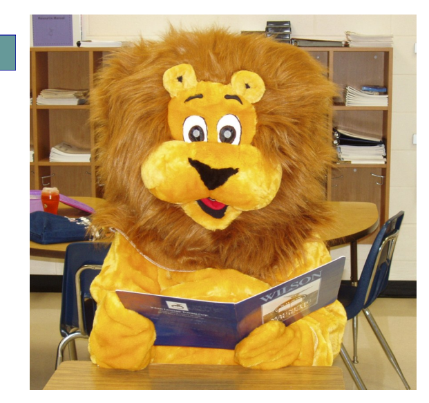
All of our students, along with our school mascot,

Pride, know that Learning is a Treasure!