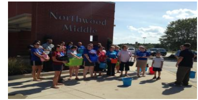
Teachers and staff support ALS with the ice bucket challenge.