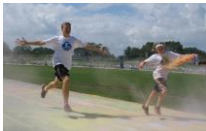
Color Run, PTA Fundraiser