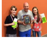
Invention Convention Winners