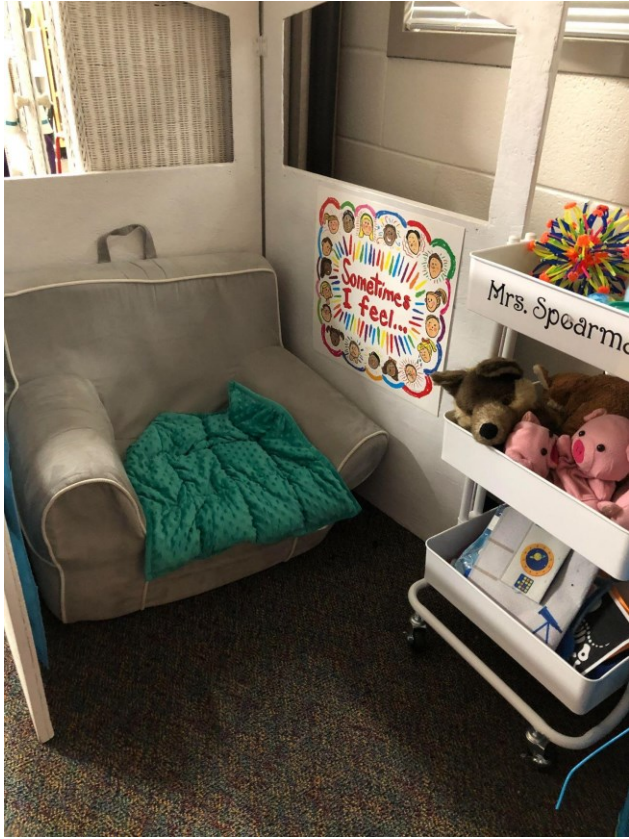
Calm Down Corner from Conscious Discipline Initiative