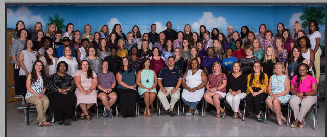
Robert E. Cashion Elementary 2018-2019