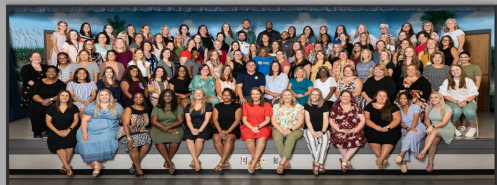
Robert E. Cashion Elementary 2022-2023