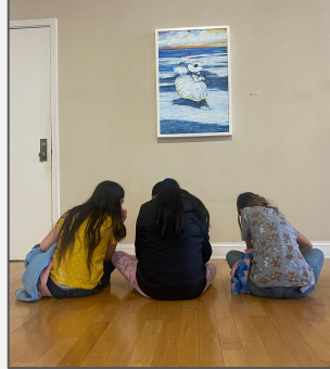
Art Field Study