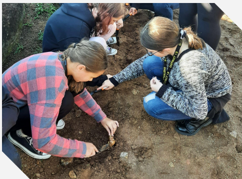
Students participating in the Daffodil Project to remember victims of the Holocaust.