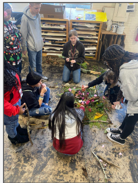
Learning art at Lander