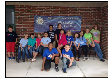
2014-15 Midland Elementary Student Council

The first annual Midland Fun Run/5K was held February 28. Donations collected from over 100 runners and event sponsors totaled $3700. The money is being used to fund the JoAnn Singleton Memorial Scholarship.