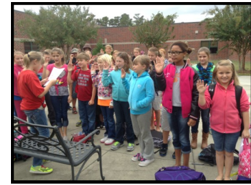
2013-14 Midland Elementary Student Council

Congratulations to all of the students, parents, and staff for their hard work.