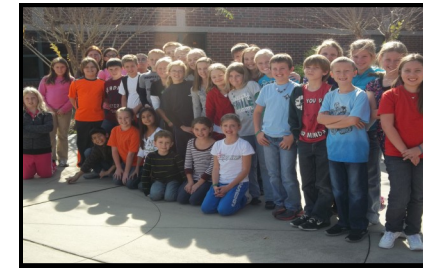
2012-13 Midland Elementary Student Council

The Palmetto Gold and Palmetto Silver awards program was created by the South Carolina General Assembly to recognize schools that attain high levels of absolute performance, high rates of growth and substantial progress in closing achievement gaps between groups of students. Congratulations to all of the students, parents, and staff for