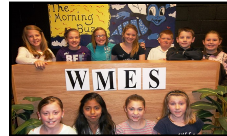
MES Broadcast "The Morning Buzz"