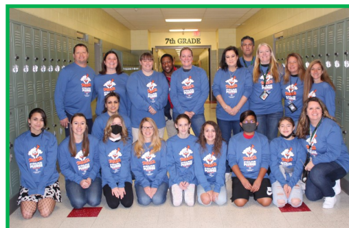
2022 Polar Plunge Team