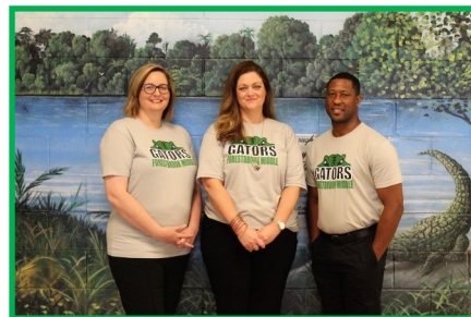
2021-22 FMS Administration