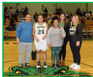
2022 Basketball Parents' Night