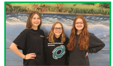
National History Day Qualifiers