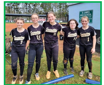
FMS Softball Players on Socastee High Team