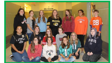
“Team Up Against Drugs” for Red Ribbon Week

Book Club and MakerSpace Junior Beta Yearbook Staff Art Club Gator Anglers National Junior Art Honor Society