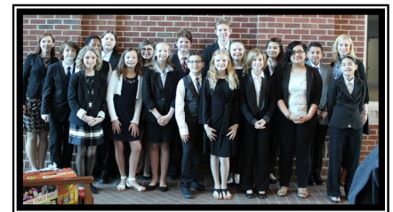
Mock Trial Team Earned Professionalism and Civility Award and 2nd Place at Regionals