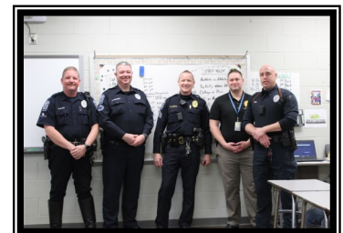
FMS Hosted 75 Career Day Presenters