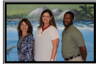
2018-19 FMS Administration