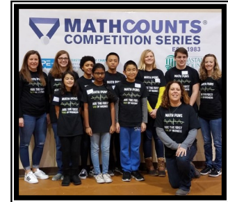
MATHCOUNTS Team Placed 1st in Region, 8th in State; Numerous Individual

Student Council Book Club and MakerSpace Club Science and Environment Club Mock Trial MATHCOUNTS Junior Beta Booster Club for Technology and Academics Tech Club Rubik's Cube Team Yearbook and Blog Staff Festival Chorus Fellowship of Christian Athletes