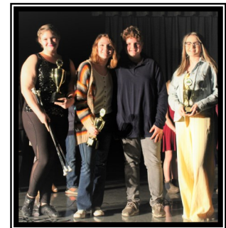
Gator Idol Talent Show Winners