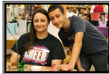
Pastries for Parents