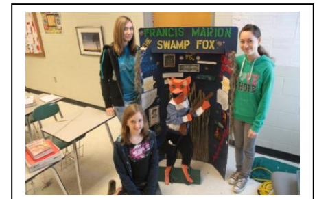
8 th Grade National History Day Winners