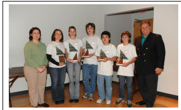
2011 Math Counts Regional Champions