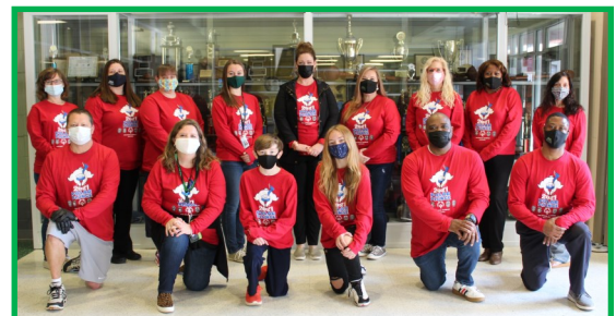
2021 Polar Plunge Team