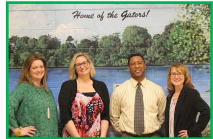
2020-21 FMS Administration