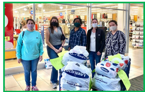
2020 Angel Tree Shopping

Active and Supportive PTO and School Improvement Council WatchDOG Dads Parent Involvement Program