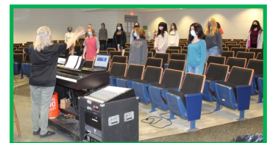
Eighth Grade Chorus