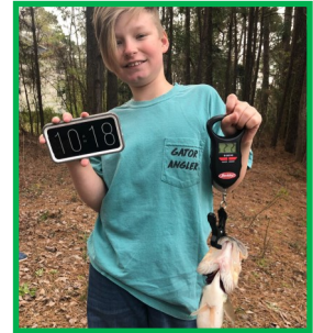
Same Day, Different Pond Virtual Fishing Tournament

Book Club and MakerSpace Club Junior Beta Yearbook Staff Art Club Gator Anglers National Junior Art Honor Society