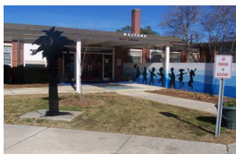
Home of the Soaring Eagles