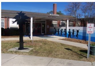
Home of the Soaring Eagles