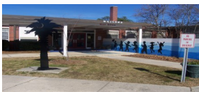
Home of the Soaring Eagles