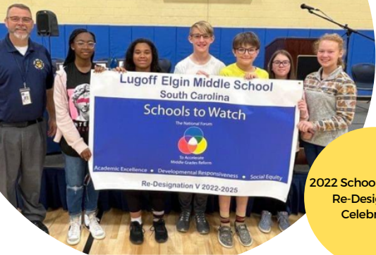
2022 Schools to Watch Re-Designation Celebration