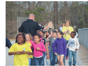
Walk to School Day