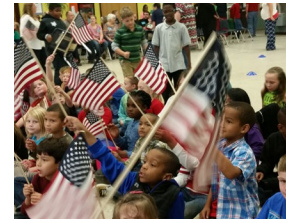
Veterans' Day Program