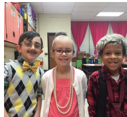
100th Day of School