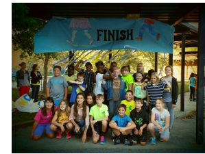
Walk to School Day