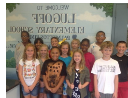
Safe Schools Ambassadors