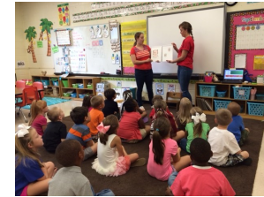
LE High School Readers