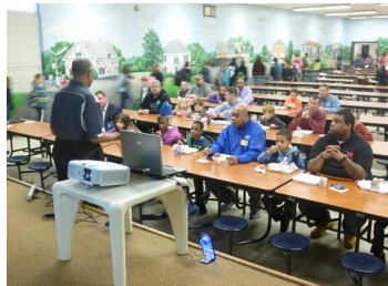
All Pro Dads Breakfast