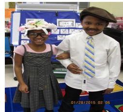
100th Day of School