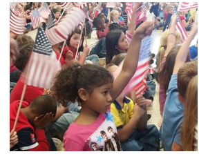
Veterans Day Program